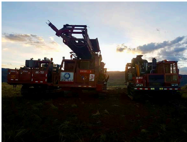
Drilling Rig & Equipment at Berenguela

Valor Resources Limited ("VAL" or the "Company", ASX: VAL) is pleased to announce that the previously announced 9,570-meter infill drill program has commenced at the Berenguela Copper-Silver Project located in the Puno Department of Southern Peru.