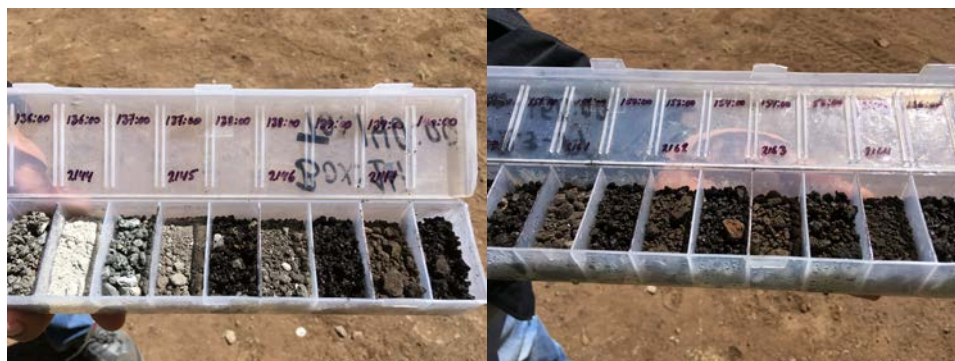
Figure 3 – Boxes of Chips of BER223-17 RC Drilling. Intervals of Zn > 3%

historical metallurgical work in order to confirm Reasonable Prospects for Eventual Economic Extraction of Zn. Zn is common in silver-enriched base metal deposits in the northern half of Peru and its presence could indicate the potential for additional resources. The presence of Zn is currently under review for the purposes of adding Zn values to the Mineral Resource Estimate. The Company will update the market once the necessary work has been completed.