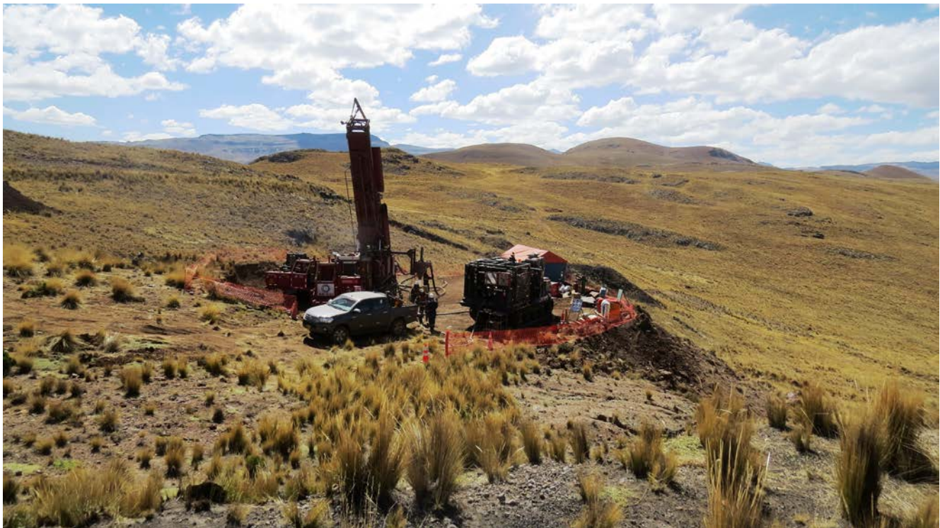
Figure 2 - Drilling at Platform 8 (BEP8) Outside Resource Shell